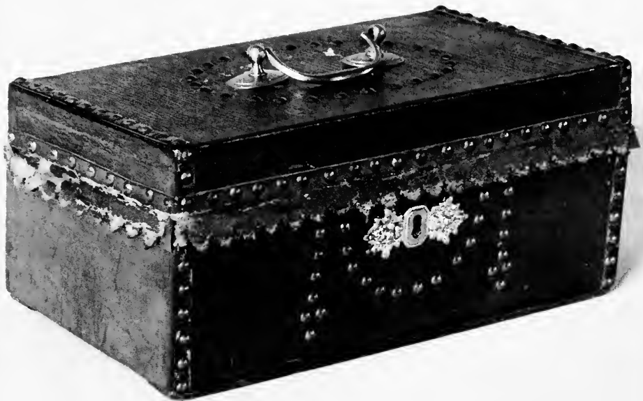
Trunk by James Roche; leather; Baltimore, Md.; c. 1825. HOA 5"; WOA 11 \frac{3}{4} "; DOA 6 \frac{1}{2} ". Private collection.